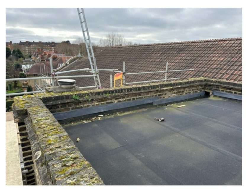
Photo 12 Location: Church (East Elevation) Wire brush all vegetation to the brick cappings to the tower, repoint brick cappings as required and renew all loose sections of cement fillet to the external and internal wall faces.