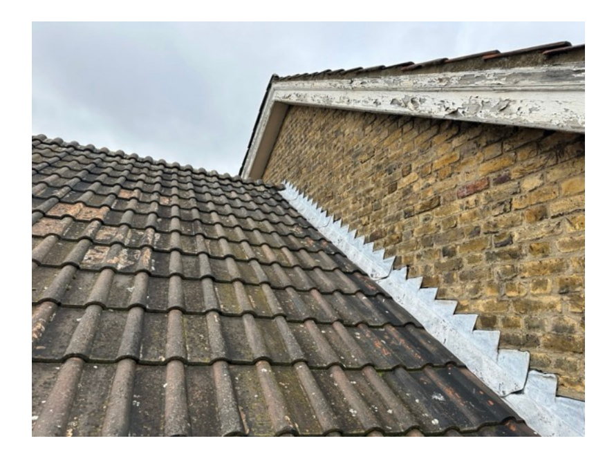
Photo 11 Location: Church (East Elevation) Retain existing barge board, rub down, fill, and redecorate.