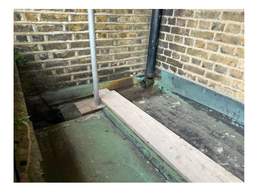
Photo 23 Location: Church (West Elevation) Replace damaged shoe to rainwater downpipe.