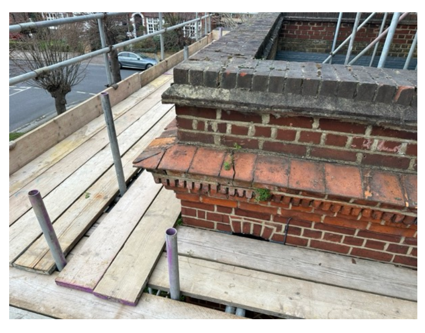
Photo 26 Location: Church (West Elevation) Replace all cracked creasing tiles.

Renew all sections of loose and missing cement fillet to the parapet walls.