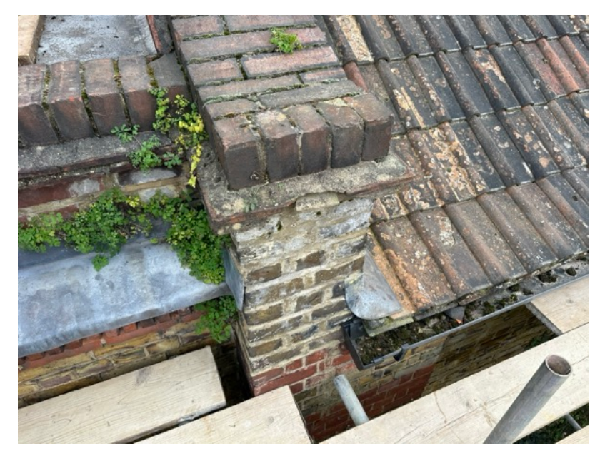
Location: Church (West Elevation) Remove vegetation growth and remove brick capping to the buttress pier to allow repair to damaged creasing tile layer. Reinstate and repoint brick capping.