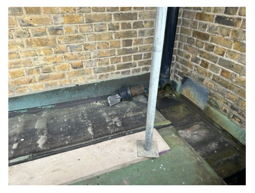
Photo 24 Location: Church (West Elevation) Reuse redundant shoe to fix downpipe in photo 23