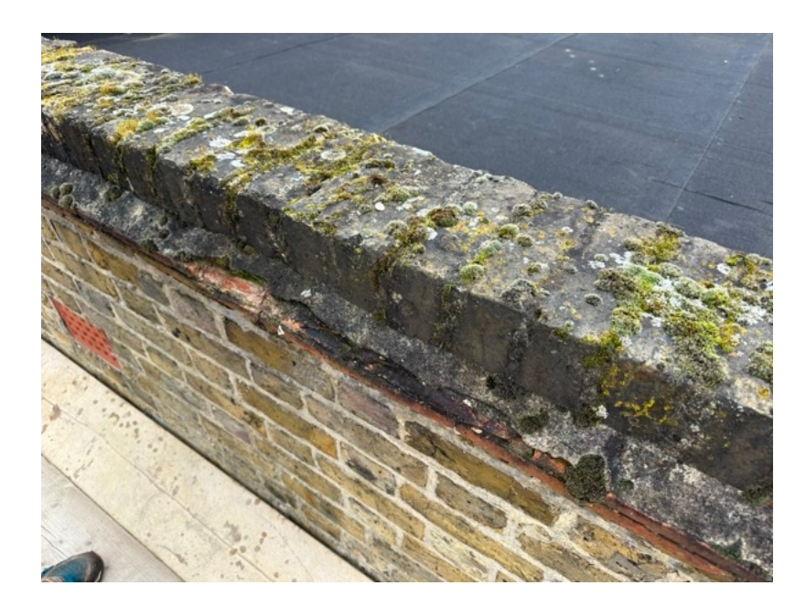
Photo 13 Location: Church (East Elevation) Comment as per photo 12.