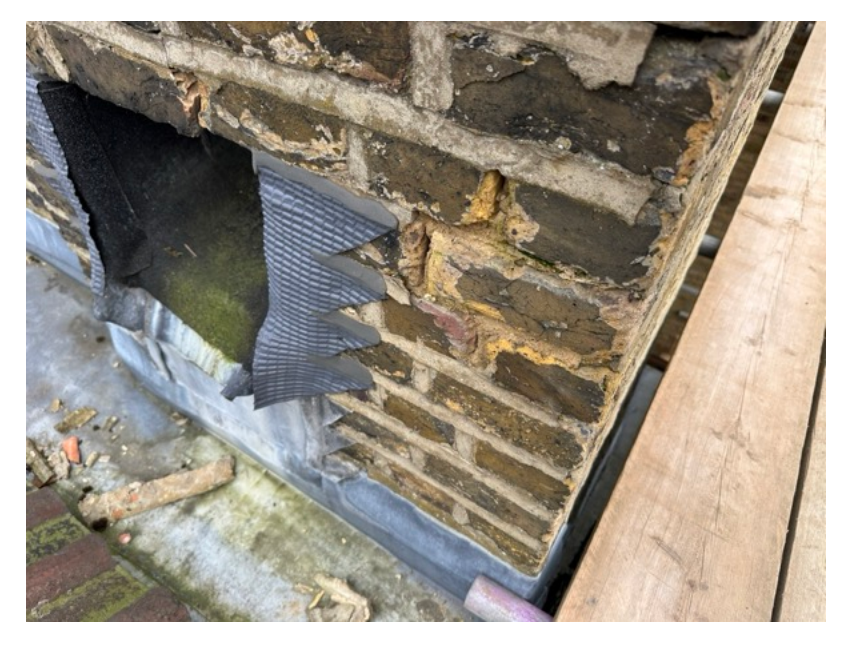
Photo 14 Location: Church (East Elevation) Repoint all eroded and missing mortar pointing around the hopper outlet to the tower roof.