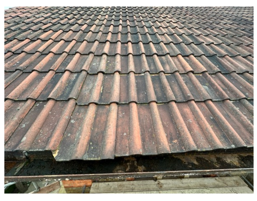
Photo 18 Location: Church (West Elevation) Refix section of slipped roof tiles.