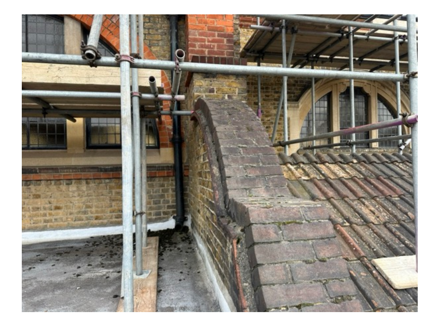
Photo 21 Location: Church (West Elevation) Renew cement fillet to the buttress creasing tiles.