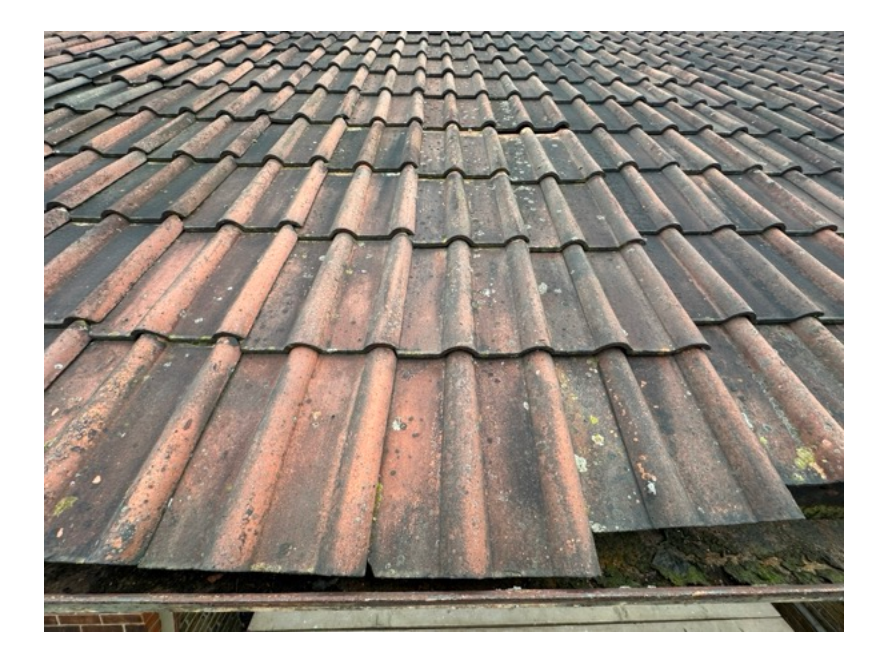
Photo 17 Location: Church (West Elevation) Refix section of slipped roof tiles.