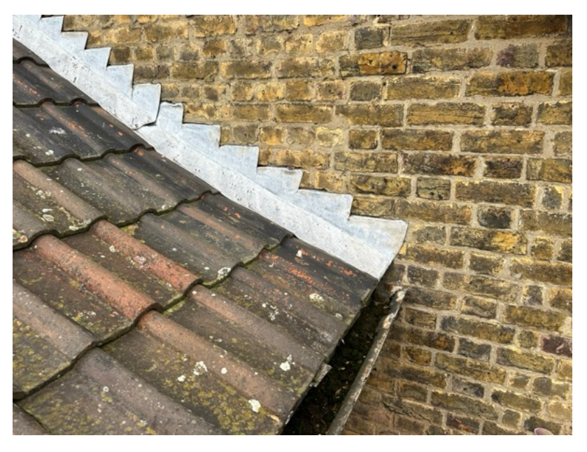
Photo 10 Location: Church (East Elevation) Repoint the flashing to the junction between the sanctuary and the main nave.

Cast iron gutters in fair condition. Clear out, seal internally and redecorate. Water test and replace any cracked or defective sections, but look to maintain original gutter wherever possible.